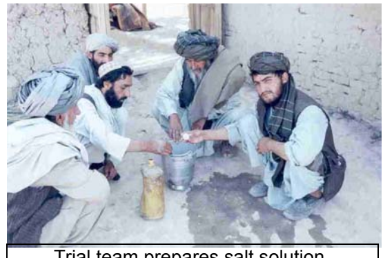
Trial team prepares salt solution

The team, at the end, made an action plan for practicing SRI from the next week. It needs to be mentioned here that rice is grown in the area only from March to August, as after September cold temperatures are a big problem for growing rice. This means that this year's season for rice is already gone. But the trial team agreed as SRI involves a number of new and careful practices that it would be good to practice the planting this year even though they would not be able to make