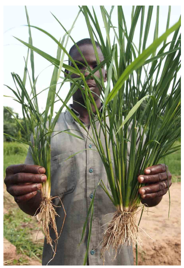
Fig. 1 - Comparison of one conventional plant (left) and one SRI plant (right), both planted at the same time with the same variety of rice by staff at the training site in Kakanitchoé, Benin.

Rice accounts for an increasing proportion of national diets across the region, though especially so in the western part. Thus, annual per capita consumption is highest in countries like The Gambia (117kg/258lbs),<sup>7</sup> Sierra Leone (104kg/229lbs),<sup>8</sup> and Guinea (100kg/220lbs),<sup>9</sup> and as a region, rice consumption is higher than for any other part