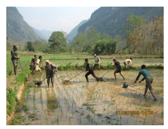
Photo 2: Communal SRI Activities for Weeding in the Nam Pa Scheme in Luang Prabang Province