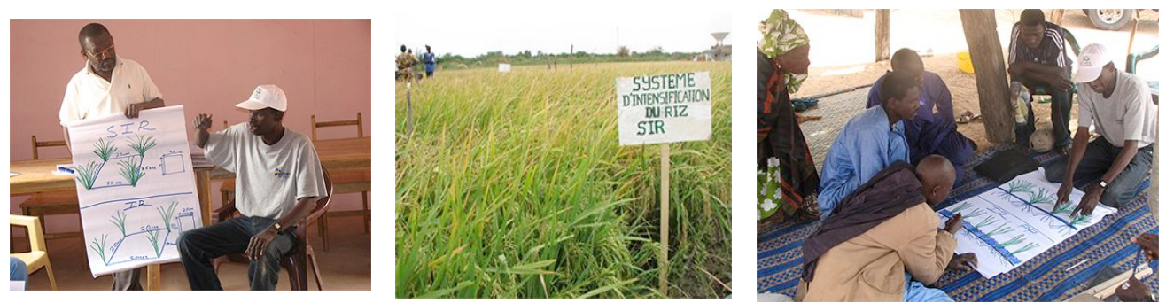
Above left to right: A meeting of the "Programme Gestion Intégrée de la Production et des Déprédateurs" (Programme GIPD, a FAO supported Farmer Field School) to discuss crop spacing in SRI with farmers (Guédé, Podor), SRI Trials by the Programme GIPD at N'Diaye (ADRAO Research Station), meeting with farmers from the Périmètre Privée Oumar Youness (Podor) to discuss crop development in on-farm experimental trials of SRI.

Proponents of SRI generally argue the agronomic and economic justification for each component as follows: