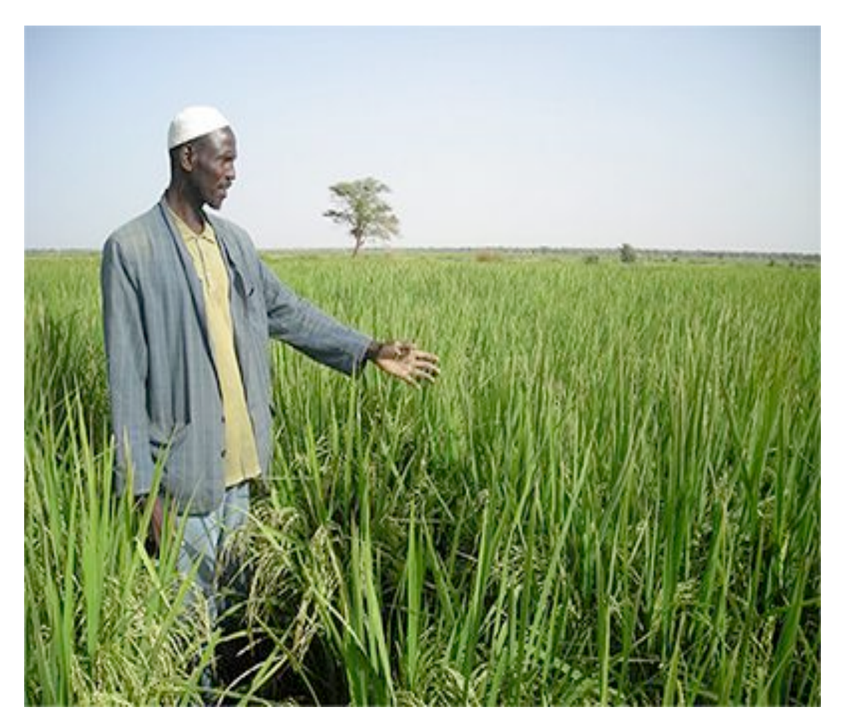
Above: A farmer showing his SRI crop grown using Sahel 202 in Guédé, Department of Podor.