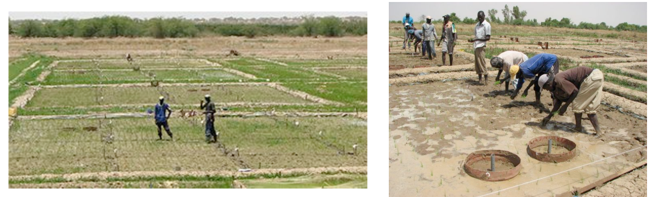
Above: SRI experimental plots just after transplanting in the variety-weed competitiveness screening trial at N'Diaye. The same trial is shown during transplanting on the right at Fanaye.

determine weed inflicted yield losses in SRI compared to conventionally managed rice. Results from the first season of these trials are still currently under analysis.