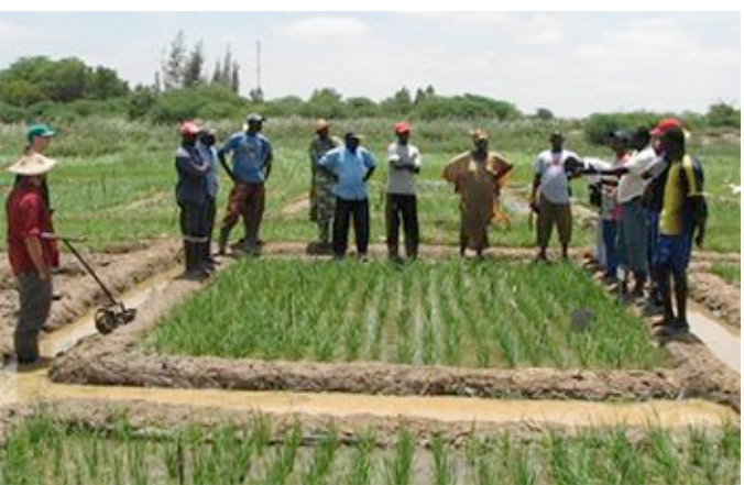
Left to right: A mature SRI crop, a visit to the experimental trials by Programme GIPD Farmer Field School Facilitators and directors. Since initiating these trials in 2007, we have hosted over 130 visiting farmers, researchers, extension agents and state officials from 14 countries in West Africa, North America, Asia and Europe.

This experiment will continue for another three seasons, but tentative results indicate that SRI has some yield advantage over conventional practices with improvements in water productivity. Nonetheless, these results must be confirmed for multiple seasons before any solid conclusions can be made.