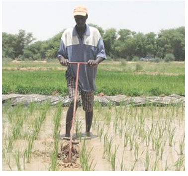
Above left: A "Cono" rotary hoe push-weeder developed at the WARDA Sahel Station for use in SRI fields. Right: The weeder in use in an SRI field in the cuvette of Nianga, Podor.