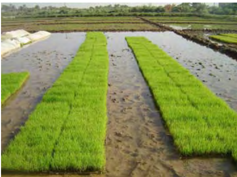
Nursery seedling boxes