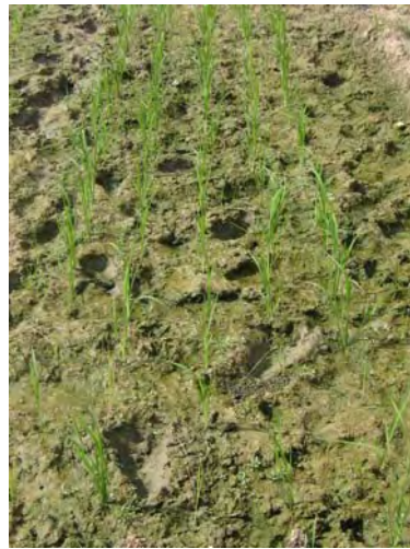
Comparison between 30 vs. 15 day old seedlings