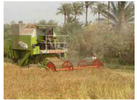
Combine harvester being used