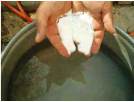
Selection of best seeds using salty water