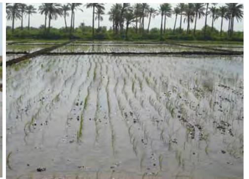
Mechanical transplanting field